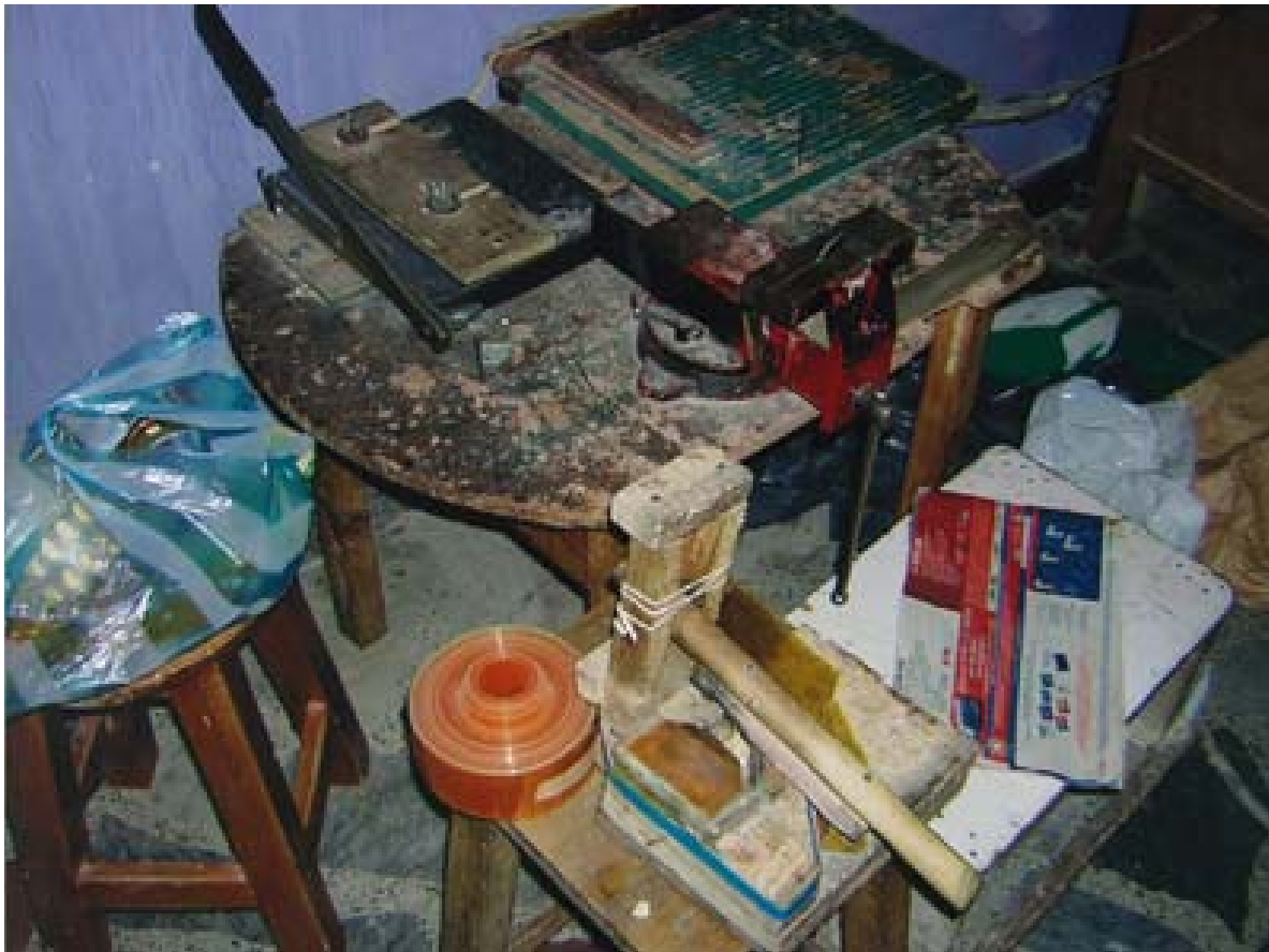
Photo from the website of Congressman Mike Rogers depicting a make-shift lab producing counterfeit Viagra™

If you believe you have bought a counterfeit drug, report it. Contact the pharmacist who sold you the medication. Your pharmacist will know if there has been a legitimate change in the color, shape, taste or packaging of the medication. In addition, ask your doctor for medical advice if you have taken drugs you suspect may be counterfeit.